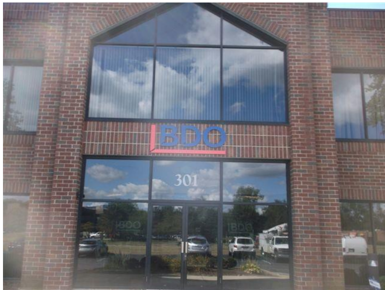
BDO's building in Akron, Ohio

PBC Advisors has been advising physicians and hospitals for more than 30 years in areas such as mergers, strategy development, interim management, financial operations, medical group formation, and provider-sponsored health plan development.